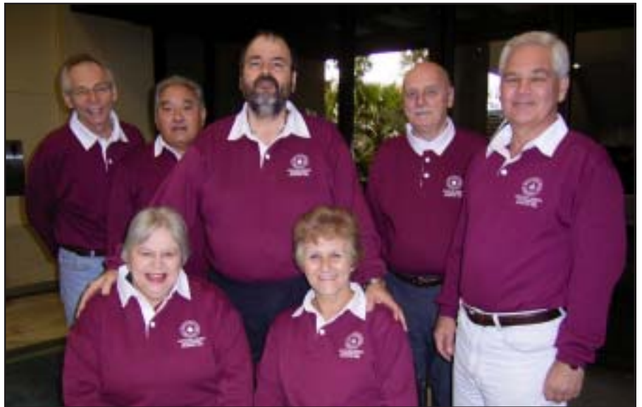
Seniors Team: top row

Let's hear from them with their ideas, choose the best and return to a winning formula.