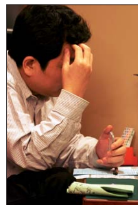
Studies in concentration from the final